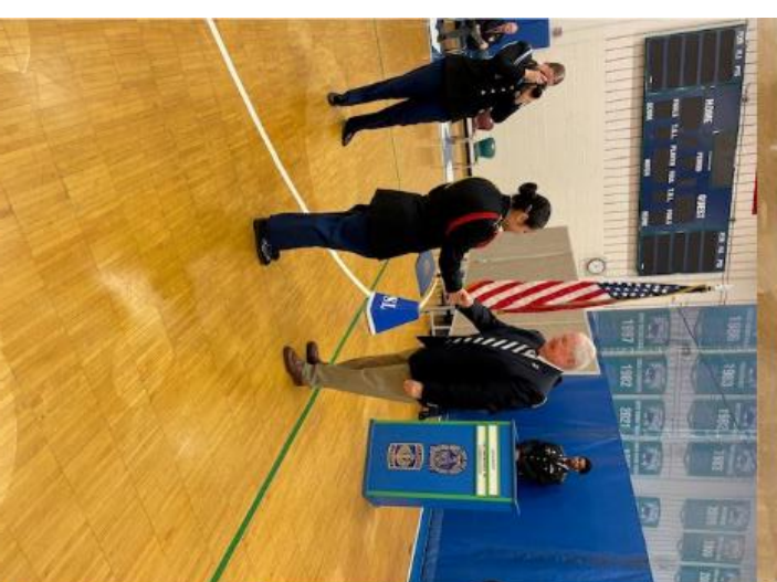
AJROTC SOUTH LAKES HIGH SCHOOL