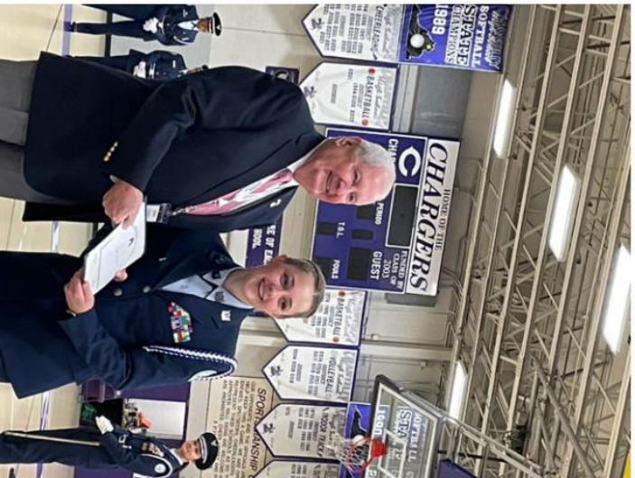
AJFJROTC CHANTILLY HIGH SCHOOL