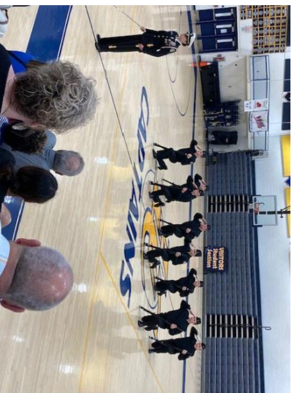
NJROTC LOUDOUN COUNTY HIGH SCHOOL