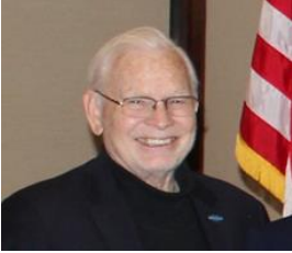
Submitted by: COL Hal Hostetler, USA (Ret)